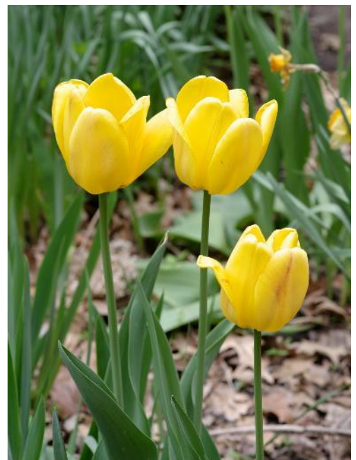
Yellow tulips in the church garden.